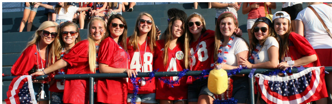
WHS Seniors show their spirit at WHS vs. Karns football game. Visit wesths.knoxschools.org for complete athletics calendar.